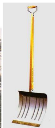
Figure 1. Big Glass