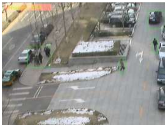
Figure 2. Finite The background subtraction detection results

In the scene, there are vehicles and pedestrians as experimental targets. The background subtraction is used to get the moving target area as the observation value.