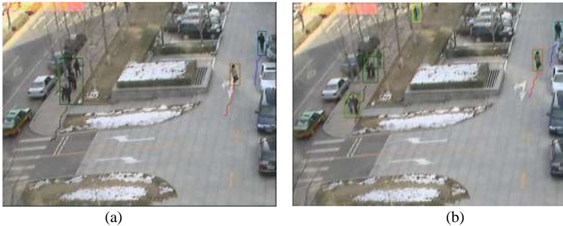
Figure 3. Finite The tracking results using PHD filtering and trajectory correlation

For better separation, two separate pedestrians on the right can get a complete trajectory tracking. The coincidence of the target has been divided into three parts as shown in Figure (a) and (b), and the track correlation tracking is the only part. The trajectory associated effect of new generation of the target is not ideal, as shown in Figure (a). This algorithm can effectively reduce the false alarm rate in multi-target tracking and improve the tracking accuracy.