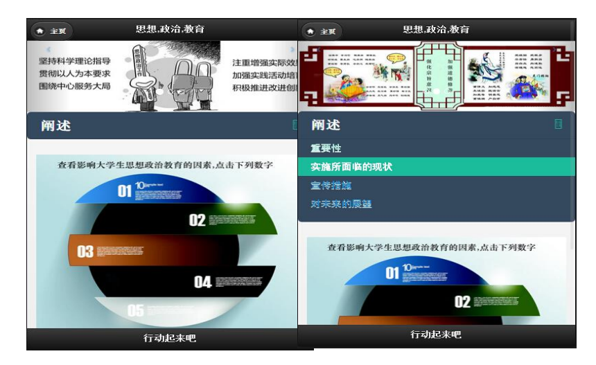
Figure 2. The application of our instruction system based on Wechat

The corresponding WeChat platform is given in Fig. 2: