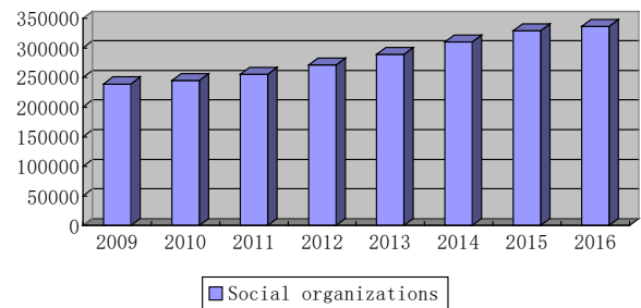
Fig. 1. Changes in the number of social organizations nationwide(2009-2016)

Since the reform and opening-up, China's social groups have continued to grow. In terms of the total number, social organizations have increased from 239,000 in 2009 to 336,000 in 2016 (Fig. 1). From the number of employees in the national social groups, it increased from 320,000 in 2009 to 360,000 in 2014 (Fig. 2)[1].