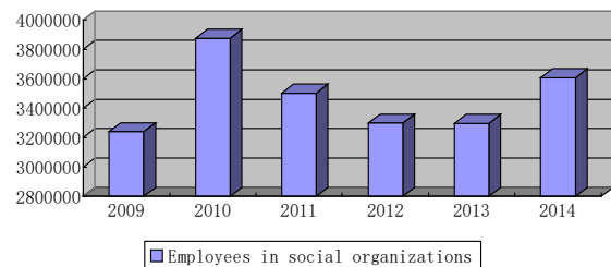
Fig. 2. Changes in the number of employees in social organizations(2009-2014)