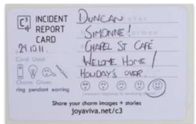
Fig. 4. Incident report cards. “Duncan’s charming work helped a friend to resist the ‘end of holiday blues’.”

It functions as a catalyst for a change in an emotionally charged situation. The idea is to empower people by giving them the tools to enact quick emotional change on their friends, colleagues, and family. The donor detaches the charm, threads it with linen and administers it to the host. It is incorporated with incident report cards in "Fig. 4" and recipient report cards in "Fig. 5" to get feedback that how the charm made them feel, and their frequency of wear.