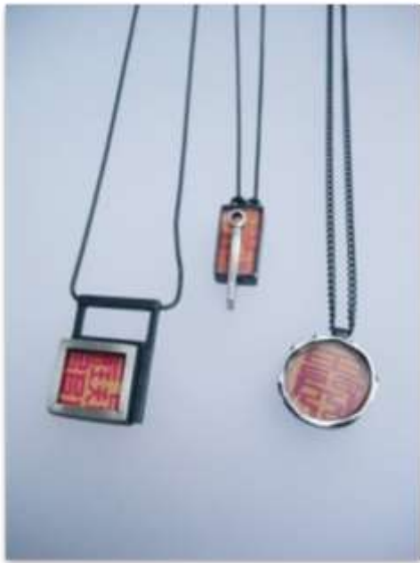
Fig. 7. For the battle of Monkey, Rat and Dragon.