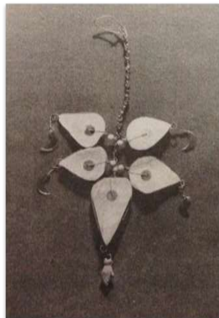
Fig. 1. Beirut, Lebanon.

In the development of human culture, the idea evolved that the magic act of transformation itself imbued a condition of magic to the changed and perfected object. This belief was projected upon all early jewelry, whose prime purpose was for use as an amulet, a charm to protect the wearer against real or imagined calamities and threats to life. Belief in their effectiveness furnished humans with a psychological means of combating the hostility of both the real and the spirit-filled world in which they lived as in "Fig. 1" and "Fig. 2".