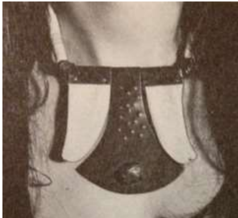
Fig. 2. Anita coudenhoje, Austria.

This is an amulet of five alum pieces held together by iron wire. Each part ends in a white metal lunar crescent, and the lowest in the hand of Fatima, both Muslim symbols of good luck, worn as protection against the evil eye. Max length 6cm; width 3 cm.