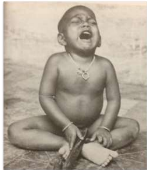
Fig. 6. Banaras, Uttar Pradesh.

For instance, the photo below in "Fig. 6" is a boy wearing silver neck and arm amulets. When hollow, these contain written paper prayers or incantations. It is worn by children all over India in belief that they protect them from various evils that may befall them before adulthood. Some potent charm pendant types are made of tiger's claws (Untracht, 1986). Hence, this silver amulet is a symbol of traditional Indian culture, which recorded the India traditional metal folk customs and legends.