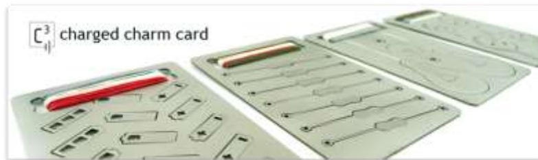
Fig. 3. Charged Charm Cards (c3) designed by Melissa Cameron & Jill Hermans.

For example, Charged Charm Cards (c3) in "Fig. 3" shown in this exhibition are credit card-sized sheets of sandblasted stainless steel from which pre-cut pendants and earrings can be punched out – and given away. The C3 artists Jill and Melissa noticed that the tradition of giving charms was often speculative; that lucky charms were often given for protection and future luck. But what if the bad thing had already happened? The artists set out to create a small kit of pieces, in the shape of a credit card, that could be used to create a piece of jewelry almost instantaneously that was always on-hand ‘in case of an emergency’. As the c3 team explains, the c3s “are best put to use in emotionally charged situations that are big enough to elicit a sympathetic response, but not so big as might require a more somber gesture (Charged Charm Cards, Joyaviva, 2012).”