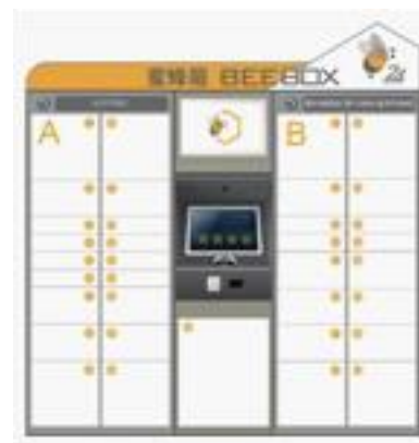
Fig. 5. Beebox mail box.