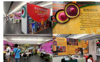
Fig. 2. Multicultural hall.