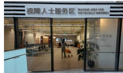
Fig. 1. Reading area for the visually impaired.

on dyslexia, provided delivering-book-to-door services, 3 opened a "learning potential" experience camp in the museum to improve the group's self-confidence, invited university professors to come and hold lectures to popularize relevant knowledge to the public and help them to be treated and recover. As can be seen from the above services, the thoughtful designs have not only better conveyed the notion of equality in front of knowledge, but also promoted the creation of livable city and new type city of Guangzhou. The overall service design of Guangzhou Library is people-oriented, considering the service experience of all groups, promoting the development of the city brand and creating a happy life for the citizens in Guangzhou.