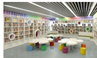
Fig. 3. "Learning potential" experience camp.