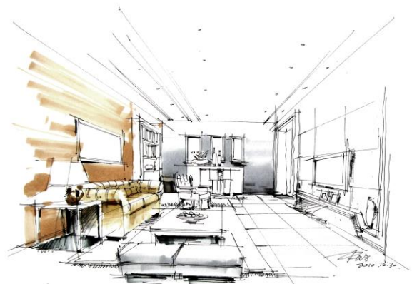
Fig. 3. The overall coloring of interior space with markers.

Third, paint the background wall with lines. Before painting, match and select colors according to color card of markers. Draw according to the structure and perspective direction, and pay attention to the change of virtual and real relationship.