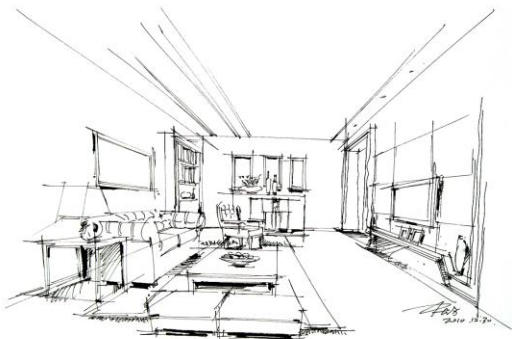
Fig. 2. Pen draft of interior space with one perspective.

To give proper expression of light and shade on the precise perspective skeleton can fully represent a space form with soul and flesh and blood. Further adjust the false and real relationship of the picture, determine the direction of light source and lighting, pay attention to the processing of projection and backlight, strengthen the decoration method of the TV background wall, the decoration of the desk and frames on the wall, the virtual and real expression of the books in the bookcase, the treatment of the lighting on the sofa background wall, and the depiction of the local details and the relation of the light and shade, until complete the draft in "Fig. 2".