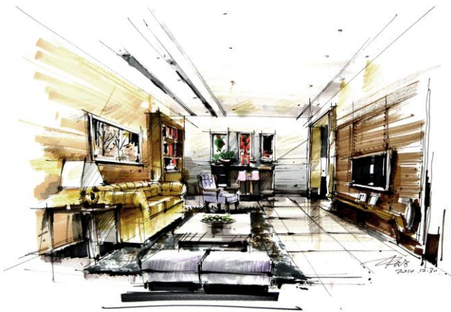
Fig. 4. Detail adjustment of interior space with markers.

Second, after the completion of the overall tone and material expression, adjust the virtual and real relation of the picture. Use color pencils to further strengthen the details, and keep the overall tone and atmosphere harmonious.