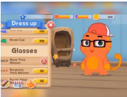
Fig. 6. Wizdy Pets interface.

Wizdy Pets is a gamified application that helps children control asthma through pet fostering. Children adopt exclusive virtual pets, select interesting tasks in the task list, and get points after the completion to buy toys and props for pets. They can play with pets, and take care of the asthma of pets, etc. The game doesn't have fixed program, so that children can explore it by themselves step by step and learn happily about asthma during the pet raising process. Wizdy Pets has also built a virtual community for children. Children can play with different friends and work together to defeat monsters, which can cultivate their team spirit. Social networking in the game also promotes children's communication. Wizdy Pets helps doctors build bridges with their children through game language they can understand, talk about diseases with children in a fun way, talk about health in an easier way, and teach them how to stay healthy, see "Fig. 6".