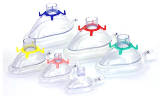
Fig. 1. Respiratory mask for children and adults.

At present, there is a large gap in the market for dedicated children's medical products in China, and children are often referred to as “little adults.” The downsizing of adult medical devices is defined as children's medical products, and actually only a small number of medical products specifically for children's R&D are designed. Taking the respiratory mask as an example, the difference between most existing respiratory masks for children and that for adult is only the difference in the man-machine size, but adults who have established medical cognition are familiar with the usage of respiratory masks while children are full of unknown fears for the masks covering the mouth and nose. Therefore, the reduced version of the respiratory mask can meet the physiological needs of children's disease treatment, but it cannot alleviate children's anxiety, and fails to meet the children's psychological needs for respiratory masks, see “Fig. 1”.