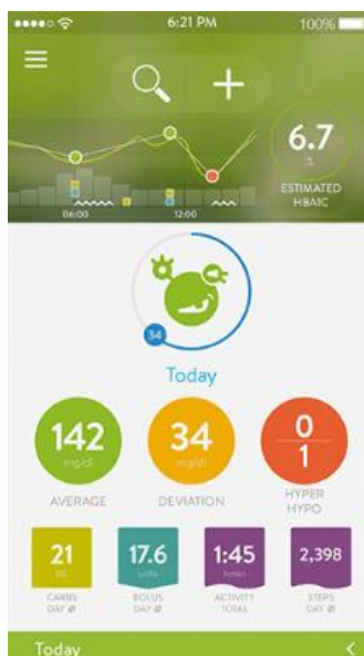
Fig. 4. Mysugar software interface.

Third is immediacy. In the gamification system, users can see the results of their own efforts immediately after completing the task. Even if it is a failure, users can easily know where the mistakes are and correct them. At the same time, in the visual feedback, the user sees that his ability has been continuously improved over time, and his actions have become more and more important to the surrounding world, which gives the user a real sense of accomplishment. For example, diabetes behavior changing game Mysugar can provide instant feedback for patients with diabetes, and users complete tasks to get points to domesticate "diabetic pets". In the process of users domesticating pets, their condition can be monitored continuously, and it instantly provides different tasks for the users with different conditions, so that users gradually change the behavior in the process of completing the task and achieve therapeutic effects, see "Fig. 4".