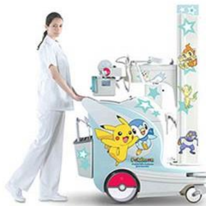
Fig. 7. Nintendo cartoon theme X ray machine.

First of all, the goal of gamification design and children's medical product design is consistent, and they are all committed to improving the experience of children's medical treatment. Good children's medical products are a combination of excellent functions and experiences. The functions of today's children's medical products have generally been guaranteed, so users have begun to pursue more "non-material" spirits and experiences, and the focus on children's medical products is gradually transferred to the children's psychology and medical experience. Gamification, based on the grasp of user motivation and demand, use gamification thinking and mechanism as design tools to induce and inspire children's curiosity, and satisfy people's pursuit of positive emotional experience [7-8]. There are numerous cases that cross-border fusion of gamification design and children's medical product design enhance the experience. For example, game company Nintendo applies the classic cartoon image Pokemon to X-ray machines, and the attractive X-ray machine makes children no longer hide under the bed to escape from check.