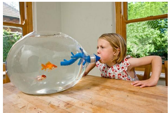
Fig. 2. Will Carey inflatable fish tank.

First is interestingness. Interestingness is the soul of the product, and it has the power to give the product emotions and life. The gamification also has the "magic" that transform ordinary things to magical things. The daily work or learning task is transformed into the challenge with storyline and full of interestingness through the game design, which can not only arouse the emotional resonance of users, but also create a happy and enjoyable experience for users. For example, the Will Carey inflatable fish tank for training vital capacity is a fish tank connecting to an air-blowing hole, and the children will improve their lung capacity by breathing to the fish tank. The treatment task is converted into an interesting game, as shown in "Fig. 2".