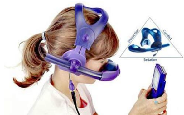
Fig. 9. PediSedate children's anesthesia game machine.

On the one hand, gamification can improve the user experience of children's medical products. In the new era of "experience economy", experience values gradually began to occupy the core position of people's daily decision-making, and high-quality user experience has become the biggest advantage of enterprise competition [10]. Gamification can transform children's medical treatment and improve children's medical experience. PediSedate, a children's anesthesia machine shown in "Fig. 9", turns tooth extraction into a musical journey in order to reduce the resistance and fear of dental treatment for children. PediSedate's shape is like a headset with a mask added to the nose and mouth. The built-in music player plays automatically when the child wears it. When playing music, the mask releases the anesthetic, so that the child is slowly anesthetized in the process of enjoying the wonderful melody of the music. And teeth are already removed when they are awake. This minor change makes children's medical products present a completely different experience. On the other hand, gamification can drive the innovation of children's medical product design, and gamification design has gradually formed a large number of creative thinking. Gamification will have more creative applications in children's medical science education, diagnosis and treatment, and rehabilitation. There will be more and more successful cases that gamification drive the innovation of children medical product design.