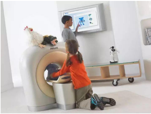
Fig. 5. Kitten Scanner nuclear magnetic resonance scanner for children.

Wizdy Pets is a gamified application that helps children control asthma through pet fostering. Children adopt exclusive virtual pets, select interesting tasks in the task list, and get points after the completion to buy toys and props for pets. They can play with pets, and take care of the asthma of pets, etc. The game doesn't have fixed program, so that children can explore it by themselves step by step and learn happily about asthma during the pet raising process. Wizdy Pets has also built a virtual community for children. Children can play with different friends and work together to defeat monsters, which can cultivate their team spirit. Social networking in the game also promotes children's communication. Wizdy Pets helps doctors build bridges with their children through game language they can understand, talk about diseases with children in a fun way, talk about health in an easier way, and teach them how to stay healthy, see "Fig. 6".