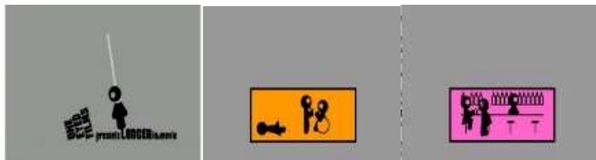
Fig. 1. Screenshot of "I LOVE Death" flash animation, 2003, 4 minutes, author H äyh ä