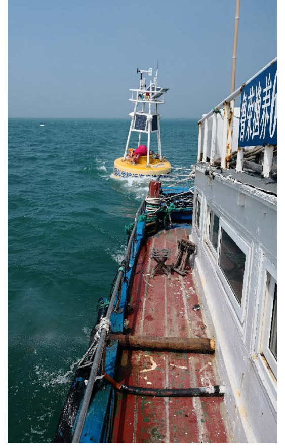
Fig. 3 Practicality picture of the towing of the buoy body at sea

buoy body, and the other is tied down of the buoy body (Fig. 2 and Fig. 3). According to adjusting the length of the two ropes, the buoy body can follow with the small fishing boat keeping the balance in the sea. It can neither be embed into water, nor be excessive fade away. The speed of the small fishing boat does not exceed six knots.