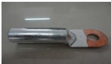
Fig.4. The terminal before improvement