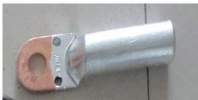
Fig.5. The terminal after improvement