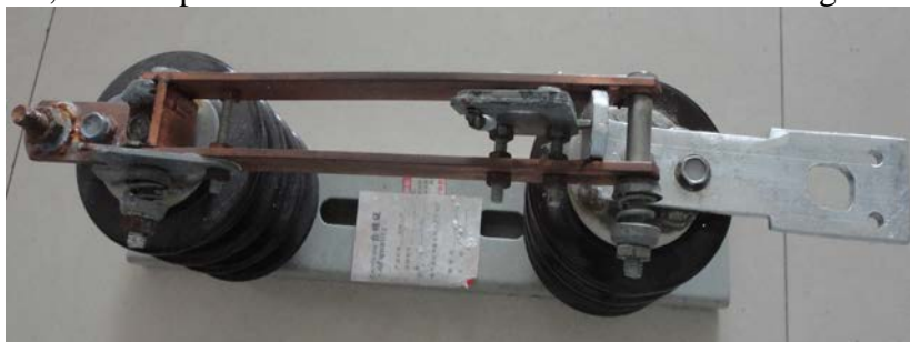
Fig.6. The terminal after improvement

After rectification, the composition of the isolation switch is shown in figure.6.