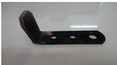
Fig.2. The terminal before improvement

In order to increase the effective contact area between the isolation switch and the terminal, according to the field measurement of the isolation switch, the pile head should be extended to 83mm, 46 mm width and 5 mm thick. According to the design process, it is shown in figure.2 and figure.3.