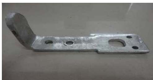
Fig.3. The terminal after improvement