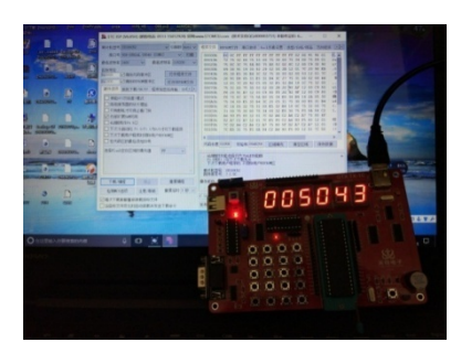
Fig. 3. Electrical clock

Students take the initiative to learn with tasks, by which they can enhance their interest in learning and cultivate their