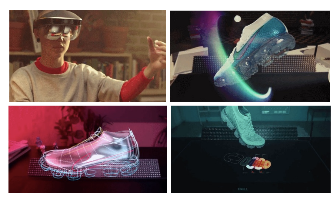
Fig. 1. Nike uses VR technology to design sports shoes

VR technology has gained fruits in many fields. The application of virtual reality technology to product development can make the design method and process more simplistic and scientific. For example, Nike has been trying to use VR technology to design more excellent sports shoes in recent years, and it has also begun to introduce related technologies in the design process. The combination of 3D modeling and virtual reality in the design process improves design efficiency and sparks designers' inspiration. Moreover, designers are available with comprehensive data information throughout the process.