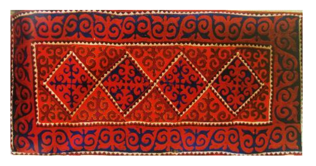
Fig. 8. Shyrdaks surface felt after the seam has completed.