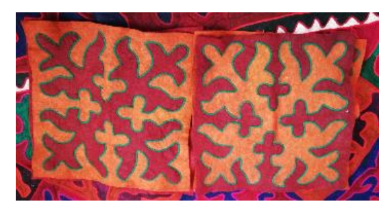
Fig. 6. A pattern unit of applique in main pattern area.

5) Stitching the decorating yarns: After stitching and fixing the applique unit pattern, Kirgiz people also carefully stitched the bright decorative varns at the joint place of the pattern, so that on one hand, the applique pattern of the joint place can be reinforced, and on the other hand, the decorative yarns are used to form a sharp outline to the pattern, thus creating a strong visual effect. Different from ordinary ethnic groups' stitching embroidery, Kirgiz women often choose two colored yarn with opposite twist directions when stitching the applique decoration line of Shyrdaks. One of them is S direction and the other is Z direction, put the two together at the joint place of applique to form the decorative traces of the herringbone pattern, and the front and back of the stitching patterns are shown in "Fig. 7". Normally after the unit pattern is patched, they stitches decoration yarns on the surface first and then apply the overall blanket.