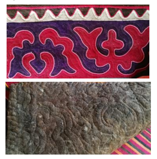
Fig. 9. Shyrdak after suture the surface and floor blanket together.

After the whole surface felt has been sewn together, it must be stitched together with the pre-made floor blanket. When suture them, thin thread is penetrate the surface felt and the floor felt with crochet hooks, because the yarn is thin and the stitches are small, so the surface of the felt leaves only a series of fine needle tracking. Generally along the outline of the decorative pattern in its inside and outside, suture a clear round stitching seams respectively, not only has the function of fixation and durability enhancement, but also form the decoration effect of a beautiful smooth stitches and concaveconvex surface. After the suture is finished, the edge of the surface felt and floor felt should be over-seamed with basket stitches, so that the edge of the blanket does not come off during long-term use, as shown in "Fig. 9". A Shyrdak with this kind of applique, not only looks colorful, but also very durable, it can be used for decades.