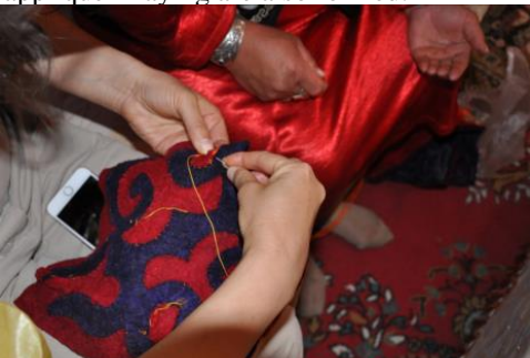
Fig. 5. Fix the two colored felt with yarn.

4) Trim applique: The most important feature of Shyrdaks lies in the patterns and color complementation. They are skillfully inlayed within each other and naturally form a harmonious and unified composition. This mutual inlaying pattern is achieved by simultaneously cutting out a pattern by disposing two pieces of basted felts fixed together with a different-colored felt, as shown in "Fig. 4", and then disassembling each other and combined together, using the pattern of the first color felt to match with the background of the second colored felt. The pattern of the second color felt is matched with the background of the first color felt, and finally form the effect of applique surface. The different colored felt and the background are first temporarily fixed with the yarn stitches, so that two unit patterns with the same pattern and opposite colors are formed, as shown in "Fig. 5" and "Fig. 6". The main pattern area of Shyrdaks is mostly composed of one or more groups of square diamond pattern units. The surrounding pattern matching areas are echoed from up and down, left and right with each other, and the composition forms of applique inlaying are also formed