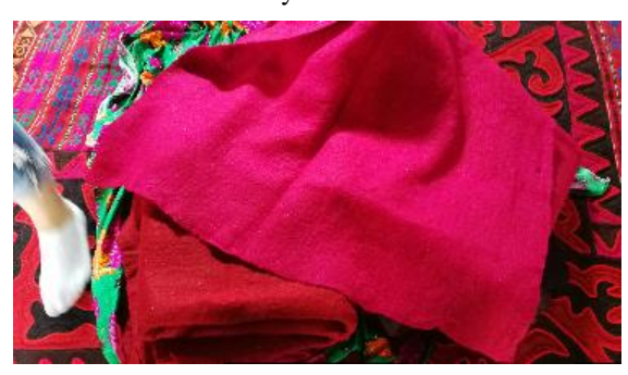
Fig. 2. The dyed thin fine felt.

The common dyes of the Kirgiz include red, orange, rose, golden, sapphire blue, green and other bright colors. When dyeing the surface felt, the original white felt is normally dyed into a pure-colored thin felt, and the surface felt to make central pattern area is often dyed in whole piece while the felt to make surrounding patterns normally dyed with strips about 30-40cm wide. In general, the color of the dyed thin fine felt for use is based on how many colors needed for the surface felt.