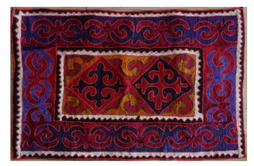
Fig. 1. The overall layout of a Kirgiz Shyrdak's surface blanket.

The surface blanket is generally made of thin fine felt that has been dyed already. It is the essence of Shyrdaks and its pattern, color matching and production process determine the overall appearance of a Shyrdak. From the perspective of the overall layout, the surface felt generally includes the middle main pattern area and the surrounding pattern matching area, which are often separated by white and black wavy strips as shown in Fig. 1. Through research, it is known that the production process of the surface blanket generally includes a series steps such as felting, dyeing, artificial sewing, trimming, and patchwork.