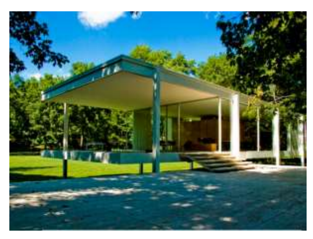
Fig. 4. Farnsworth house.