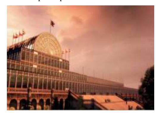
Fig. 1. "Crystal palace" rendering.

The development of modern architectural ornament is closely related to the development of modern design, which movement began in Britain in 1850s. The "Arts and Crafts Movement", represented by William Maurice, opened the design and development path suitable for the modern industrial system under the large-scale industrial background [3]. During that time, the architectural design was also under changes - the application of new materials such as steel and glass, the improvement of the long-span steel frame structure and the implementation of the assembly system lead to the huge changes in architecture world, and finally gave birth to a unique building, "Crystal Palace", see "Fig. 1". The meaning of "Crystal Palace" is that it completely subverted the concept of architectural form in the past, displayed a completely new appearance in front of the world, formed a completely different architectural style from the period of Vitoria, see "Fig 2" and opened the development path of modern architecture.