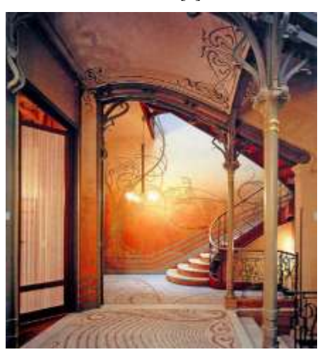
Fig. 3. Cyrus residence interior.

design movement of "Modernism" was conceived and developed in such soil, with the slogan of "form follows function", affected the development of architecture for more than half a century since then[5]. The extensive application of the modular system and the mechanization of the assembly process made the production efficiency of the architecture industry greatly improved, and the decorative craft that was stuck in the traditional manual operation has obviously been unable to adapt to this great industrial change, so it gradually being replaced by the style that can adapted to the modern architecture structure and technology - simplicity, concise and natural in "Fig. 4". This simple style is not only refreshing, but more importantly, it fits perfectly with the efficiency requirements of the modern construction industry. When saturated seeds meet suitable soil, vigorous development is inevitable. Although various post-modernism architectural movements have sprung up, the essence was an amendment to modernism. The foundation of the "form follows function" advocated by modernism has not changed, and the architectural ornament has not returned to the tedious style of the Victoria period, simplicity has been the mainstream style after the "modernist architecture" [6].