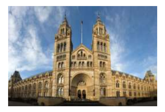
Fig. 2. The history museum of Britain.

Of course, the emergence of new things is always accompanied with great criticism; "Crystal Palace" was of no exception. People regarded it as a huge and ugly architecture situated in the park like a grave, with no classical architectural beauty, even the designer Joseph Paxton received many verbal attacks from some radical groups. However, the emergence of new things, after all, has its logic. The construction of the "Crystal Palace" is the inevitable result of the application of new materials and new technologies in the field of architecture. Although it was contentious, it opened the prelude to modern architecture and inspired people to think about how to coordinate the relationship between ornament and function under the new technical conditions.