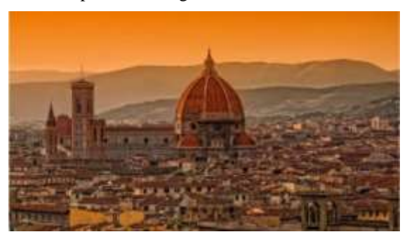
Fig. 6. Florence ancient city.

and as the main component of the building, the details of the surface should be treated as simple as possible to reduce unnecessary information load, which can improve the efficiency of information processing. This is an inevitable choice for complex urban organic bodies.