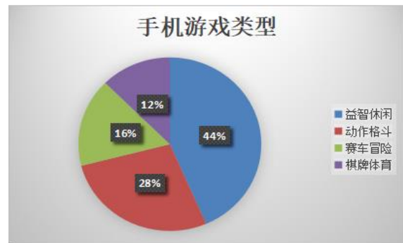
Fig. 2 Data about the children's favorite games

(2) Figure 2 is the type of the favorite mobile games for the children aged 4 to 6 years. Blue is an puzzle leisure type, accounting for 44%; Red is the action fighting type, accounting for 28%; Green is a racing adventure type, accounting for 16%; Purple is the chess sports type, accounting for 12%.