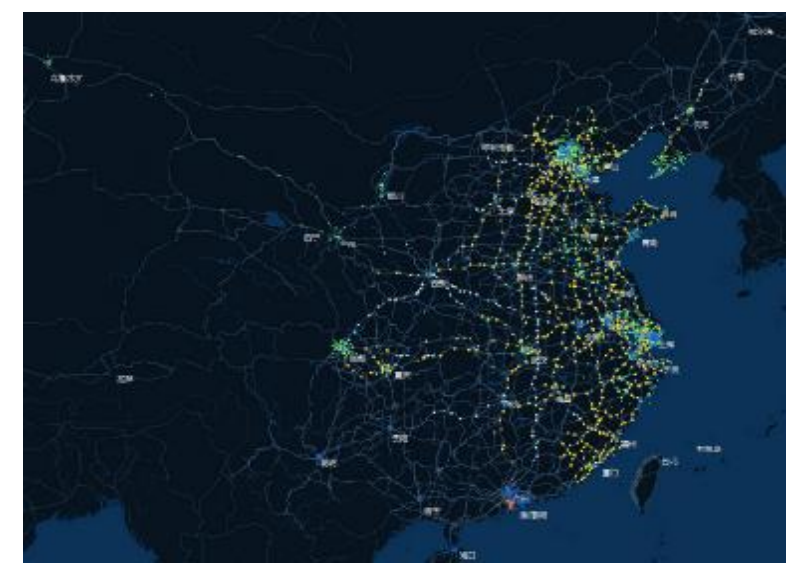
Figure 5 The layout of charging pile status in China