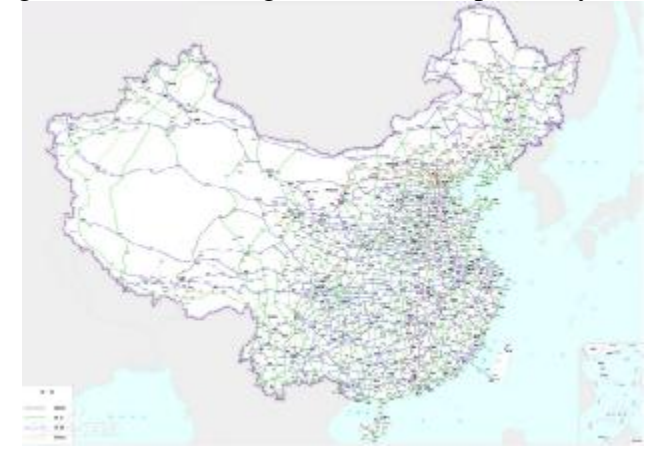
Figure 2 The Planning of Ordinary National Road in China

From the perspective of Water Transport Network layout, the total mileage of China's inland waterways is 127,000 kilometers at the end of 2017, where, the level 2 and above navigable routes 125000 kilometers, 4th-level fairways 10781 kilometers. There are 27,578 berths for production in the country, where, 5830 berths for production of coastal ports and 21748 berths for production of Inland port. According to the National Inland Waterway and Port Layout Planning (2006-2020), It plans to form about 19,000 km of high-grade inland waterways, forming a high-grade channel network (referred to as 2-1-2-18) and 28 major port layouts of "two horizontal, one vertical, two networks and eighteen lines". According to the "port and shore electricity layout plan", More than 50% of the ports in major ports and ship emission control areas in the country have built containers, passenger rolling, cruise ships, passenger transport of over 3,000 tons, and specialized berths of dry bulk cargo of over 50,000 tons. The company has the ability to supply shore power to ships by the end of 2020. There are 493 specialized berths capable of supplying shore power to ships in ports in major ports and ship emission control areas across the country<sup>[7]</sup>.