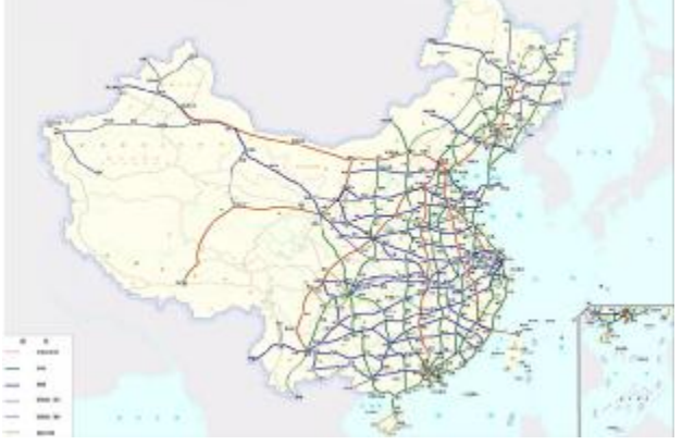
Figure 1 The Planning of National Expressway Network

(2013-2030)", the road network planning will reach 401,000 kilometers. Where, the general national network consists of 12 capital cities, 47 north-south vertical lines, 60 east-west horizontal lines, and 81 tielines, with a total size of approximately 265,000 kilometers. The national highway network consists of 7 capital cities, 11 north-south vertical lines, and 18 east-west horizontal lines, as well as regional loops, parallel lines, and tie lines, and approximately 118,000 kilometers, the long-term prospect line is 18,000 kilometers<sup>[7]</sup>.