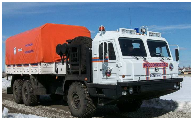
Fig. 3 The Arctic modification of "Voshchina-1" for the Ministry of Emergency Situations

Transport Machines Plant in Nizhny Novgorod (OOO TransMash) produces wheeled snow and swamp-going vehicles with extra-low pressure tires belonging to TTC 3007 Kerzhak and TTC 3901 Unkor families, track snow and swamp-going vehicles of TTC 3401 Vetluga family, as well as other technical transport vehicles [TTC].