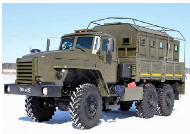
Fig. 4 "Urals-4320" in cold climatic modification

Availability of all-terrain vehicles adapted for operation under Arctic conditions will improve safety of transportation service, promote development of advanced logistic processes in remote and difficult to reach populated localities of the Arctic and stimulate design and construction of vehicles for passenger transportation. Unique engineering solutions in the field of development of all-terrain vehicles for arctic regions are very important. They make arctic regions more accessible by transport and improve mobility of population. The task calls for constant upgrading of vehicle manufacturing process and full range of development and certification testing under natural low-temperature conditions of Yakutia.