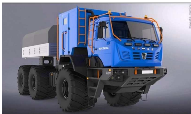
Fig. 2. All-terrain vehicle with mobile house "KamAZ Arctic"

Technical Regulation of Customs Union [TRCU] on Safety of Wheeled Vehicles has been effective since 2015. However, the requirements of this Technical Regulation fail to consider specifics of the road and climate conditions of the Arctic, and do not allow for lawful long-terms modifications of design solutions performed by the operators. Standard vehicles, which have undergone a conformity assessment procedure, are unfit for service (and unsafe) during winter season in such regions. One of the problems derives from Technical regulations, which prescribe strict rules regarding changes to vehicles' design, making it almost impossible to legitimately modify and improve standard models to adapt them for operation under Arctic conditions. Certified testing laboratories (centers) listed in the Unified Register of Certification Authorities and Testing Laboratories (Centers) of Vehicles should draw a conclusion of preliminary technical examination and safety inspection of a vehicle design after its modification.