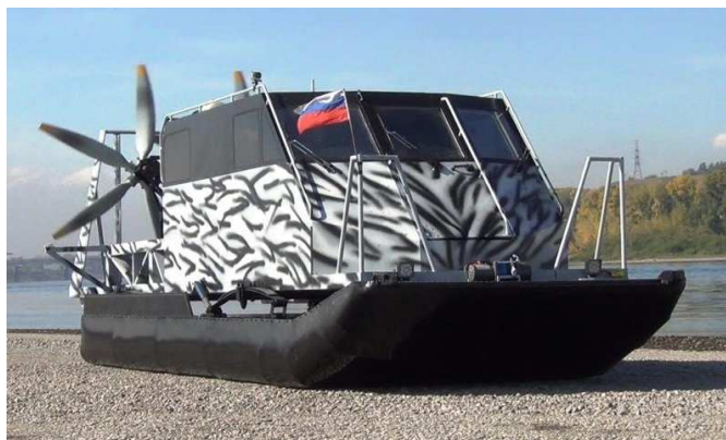
Fig. 5. An amphibian snowmobile "the Seal 655" made by LLC Aerospetstrans

655 by Siberian Company OOO Aerospetstrans (fig.5) was manufactured using high-strength aluminum alloy resistant to extremely low temperatures. Unlike other models, this snowmobile is fully adapted for operation under Arctic conditions; therefore, it is safe to say that this aerial all-terrain vehicle is suitable for operation in Russia, especially in the north where there are no permanent roads.