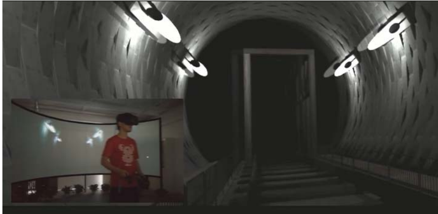
Figure 3. Tunnel Module Based on Innovative Project Developed by the Student.