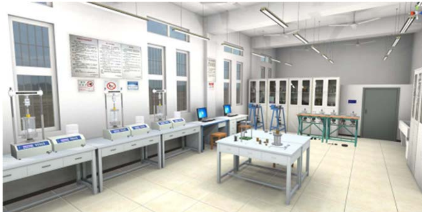
Figure 2. Virtual Simulation Lab of Civil Engineering in Beijing Jiaotong University