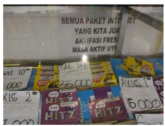
Fig. 2. The Prepaid Starter Pack, sold in active mode and ready to use

Providers. In the Regulation of the Minister of Communication and Information No 14 year 2017 on Article 16, the period of blocking is one month after the regulation enacted, and the Internet simcard sold in activated mode without registration—(the validation of consumer data ) which should causes vulnerable abused; March 26th 2018, there is a registration process with the option of entering the name of consumers' Mother;