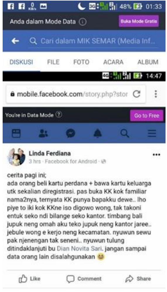
Fig. 3. Data Abuse

There's no action to take down site on the Internet and arrest the people which published NIK and KK Numbers illegally; Regulation of Regulation of the Minister of Communication and Information Technology Number 14 of 2017 Legal defects; Regulatory regulation does not have adequate legal certainty. There is no mechanism of consumer protections who was a victim of misuse of a simcard. Regulation of Minister Communications and Information Technology Regulation No. 21 of 2017. Legal defects; Registration Format is still showing an option for filling the mother's name. Provider of Telecommunication Service, and There is no attempt to protect its customers as victims of misconduct of prepaid simcard; The telecommunications provider did a wanprestasi, stated they were not authorized to block simcard services unilaterally, even if a prepaid consumers perform various forms misuse of prepaid simcard; The complainant support service is not working properly.