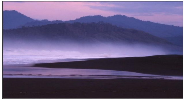
12 Lumajang; pagi di Pantai Bambang, Kec. Tempeh 60 X 35