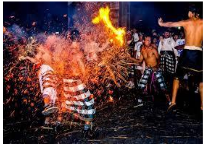
Fig 3. Malukat Geni dance

c) Malukat geni or war of fire . This activity is done by the local community of paksebali in Pesamuan or Puri Satria Banjar Kawan which coincides on the feast day before the Nyepi and held once a year