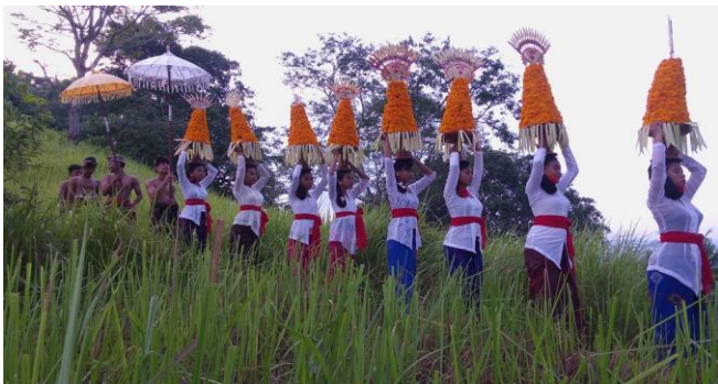
Fig 2. Paksebali Village Hill with beautiful panorama.

b) Paksebali Village Hill . It is a row of hills stretching through Paksebali Village from west to east, these hills are usually used for tracking facilities, selfie and photo group.