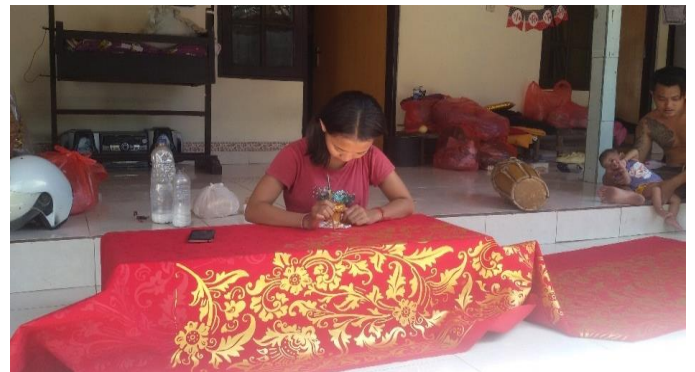
Fig 4. Prada handicraft (painting on the fabric).

Furthermore, another Social Community tourist attraction is community-based handicraft. Paksebali Village has a wide range of crafts that are in great demand by local and foreign guests, such as: woven craft of endek , prada , bludru , alang alang roof , gambelan , customized umbrella, reversed glass painting and many more