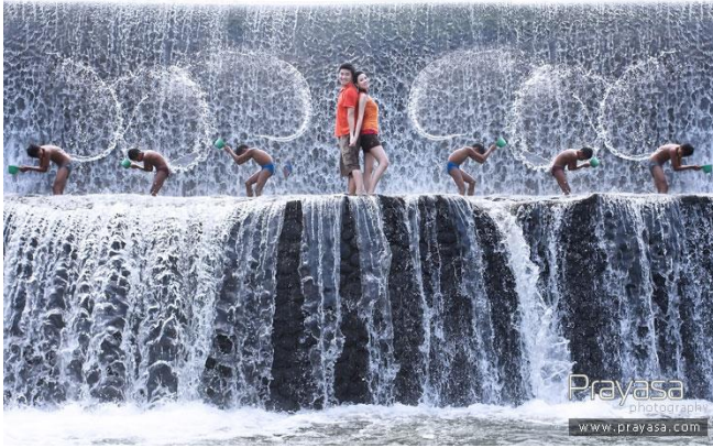
Fig 1. Tukad Unda is a natural tourist attraction as the location of pre-wedding photo as a main product

b) Paksebali Village Hill . It is a row of hills stretching through Paksebali Village from west to east, these hills are usually used for tracking facilities, selfie and photo group.