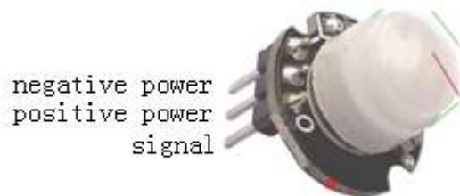
Figure 3. Miniature human infrared induction module PM-6

The external circuit of the miniature human infrared induction module is simple. Its pin connection diagram is shown in Figure 3: pin 1 is signal terminal; pin 2 is positive power terminal; pin 3 is negative power terminal.