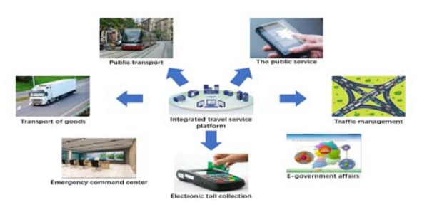
FIGURE I. INTELLIGENT TRAFFIC EMERGENCY COMMAND AND DIS

Through this platform, the public can enjoy a convenient, quick and simple travel experience. With the help of Internet technology, resources such as ticketing system information, map information, traffic flow information and travel information are all integrated, and citizens can obtain targeted information from them to achieve a one-stop service for citizens to travel.