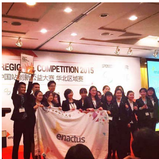
Fig.3. Students own the first place of Innovation Contest

Also, the incorporation of experimental teaching, practical teaching, training of competitive abilities, and progressive training of company's internships has greatly improved the employment competitiveness of students. We have established coop-programs with many companies, including 'Alibaba', 'IBM', and 'Baidu' in the students' practice and scientific research. We encourage students to participate and practice the enterprise learning in real enterprise operations, network marketing, platform development, etc., and master the most advanced knowledge and skills of the E-commerce industry.