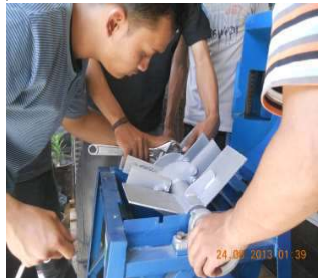
Figure 5. Setting the number of Blade

This hammer mill machine has 9 chopping blades, of which 6 knives are in the knock down position, while 3 blades are in a fixed position. Setting the number of blades aims to determine the optimal number of blades to count organic waste so that the fast counting process with quality chopped results. This knife serves to destroy the material (waste) that is in the blade housing. The blade works with a rotary system, where the cutting speed adjusts the motor rotation speed as the input rotation. Setting the number of counter knives is shown in Figure 5.