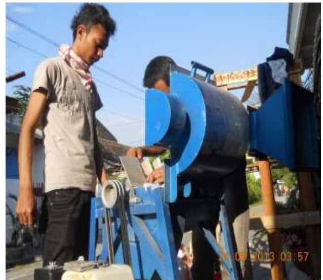
Figure 4. Examination of variasi blade angle

Blade angle adjustment is performed to determine the exact and optimal position of the blade angle to produce the best engine performance that can produce optimal destruction. Variations in the angle settings used are 30°, 45° and 60°. In each blade angle variation, the sampling process of waste counting / destruction is carried out 3 times. In the blade angle setting, high precision is needed, so that the enumeration process is fast and easy to go out. By fitting the right angle position, the blade turns to chop faster, and the chopped results are softer and faster to get to the outer funnel. Blade angle variation testing is shown in Figure 4.