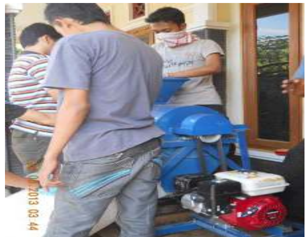
Figure 3. Assembling Multifunction Hammer Mill Machine

Assembling that has been carried out according to design produces one hammer mill machine unit with the following specifications, 1) Capacity: 300 kg / hour 2) Dimensions: 115 x 65 x 125 cm, 3) Power: engine 5.5 PK Honda or Electric Motor 2 HP, 4) Blade: cold work steel (58-60 hrc), 5) Blade system: knock down can be disassembled , 6) Seat plate: Iron pipe □□40 mm, 7) Frame material: Iron plate strip 2 "and iron elbow 60x60 cm, 8) Function: cutting, destroying, and smoothing straw, twigs, livestock droppings, and organic matter Other results of assembling Multifunction Hammer Mill Machine as shown in Figure 3