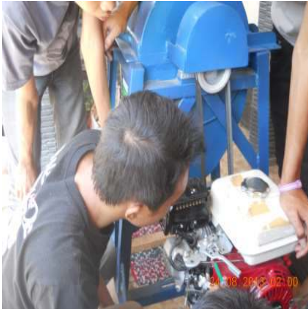
Figure 6. Setting of cycle engine

the rotation, the higher the energy produced to destroy waste so that the rate of waste counting is faster. Figure 6 below is setting the motor rotation on a hammer mill machine.