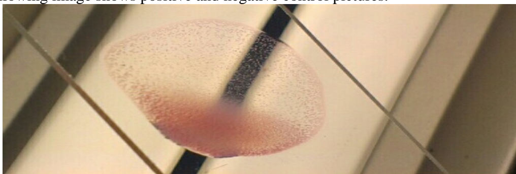
Positive (with agglutination granules)

The following image shows positive and negative control pictures.