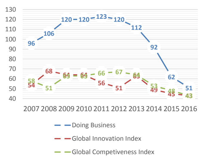
Fig. 1. Dynamics of Russia's positions in the innovative development ranking (synthesis according to Doing Business, Global Competitiveness Index, Global Innovation Index electronic resources).

The analysis of the Russia's positions dynamics presented in Figure 1 demonstrates positive trends. The "Doing Business" rating analyzes two key aspects: National Business Initiative and the Index of Russian regions innovation development. Russia has advanced within this framework from 123rd place in 2011 to 51st in 2016. The "Doing Business" ranking is only indirectly related to innovation: it measures the success of government actions to provide a decent business environment for all types of companies. Nevertheless, a favorable environment is a basic prerequisite for innovative development. According to the "Global Innovation Index" rating, in six years Russia has improved its result from 64th to 43rd place, with approximately the same picture visible in the ranking of the "Global Competitiveness Index" (growth from 63rd to 43rd place). Researchers also point to the level of the general survivability increase among companies in Russia and steady growth of their stability in companies since 2000, but at the same time, the volatility increases their average life period (Guseva, V.E., Kuzmin, E.A., 2016; Kuzmin, E.A., 2018)