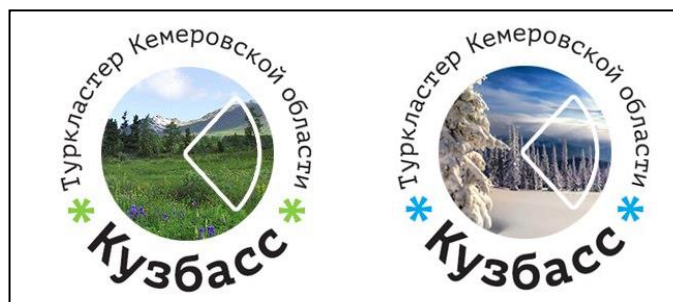
Fig. 2. Logos of Tourism and Recreation Cluster of Kemerovo Region.

The coal theme can be presented in a more humanitarian context, for example, as “Kuzbass, giving energy and light, and bringing heat”. The undisclosed mysteries and the unknown unique attractions of Kuzbass have become a symbolic theme of the brand book of the Tourism and Recreation Cluster of Kemerovo Region. Its main logo, symbolizing the search scanner and fitted in a circle, forms stylized letters “K” and “O” (for Kemerovskaya Oblast’ – Kemerovo Region), and stands for “territory of discoveries”.