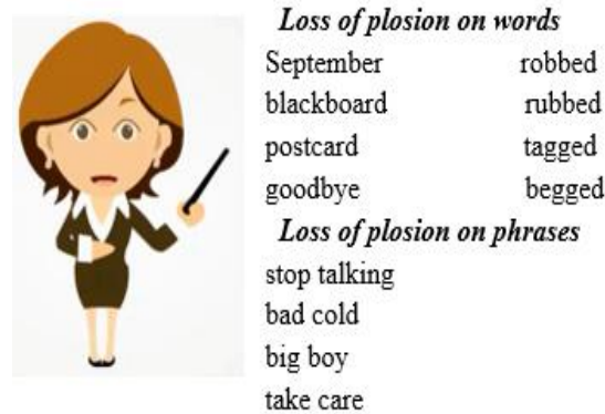
Figure 4. GIF animation

The teacher applies the Adobe Photoshop software to produce Gif animation, see Fig. 4.