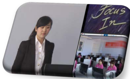
Figure 3. Microlecture

The teacher applies a live shooting method. There are two cameras in a room about 30 square meters, one is at the front and the other is at the back. We must keep the room quiet and keep a distance from the disturb origins. The teacher installs the screen recording software in the computer. So we can see the teacher activities, teaching contents and students activities simultaneously, see Fig. 3.