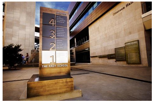
Fig. 3. University of California, San Diego Guide System 2.