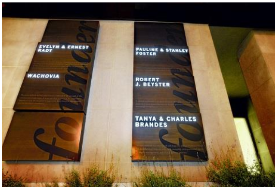
Fig. 2. University of California, San Diego, Guide System 1.