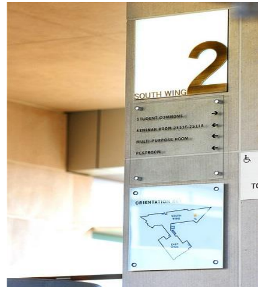
Fig. 4. University of California San Diego Guide System 3.