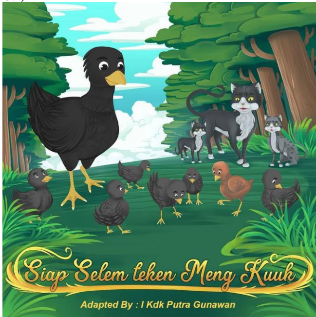
Fig 1. Photograph image of cover Siap Selem teken Meng Kuuk (Nusantara Katur Community)

involved in this story with the term Meng Kuuk (Naughty Cat).