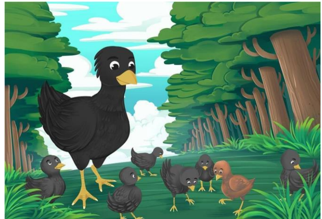
Fig 2. Photograph image of page 1 (Nusantara Katur Community)

each page. In addition to text, visual or image display plays a very important role in this work, the images presented with the visual appearance and distinctive colors on each page can attract the attention of the audience or the reader in listening to the contents of the story to develop their imagination.