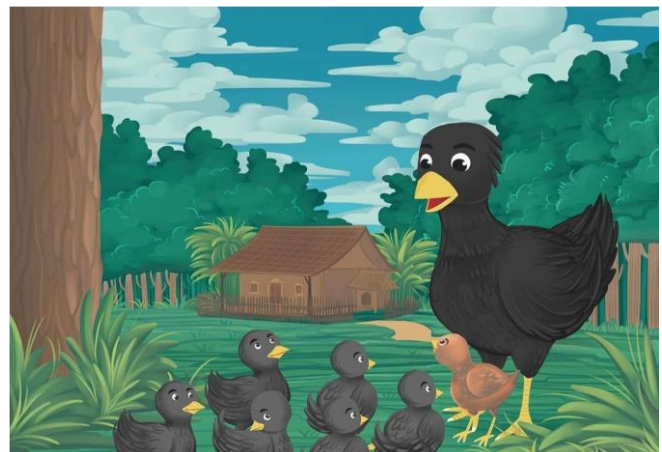
Fig 3. Photograph image of page 2 (Nusantara Katur Community)

Figure 3 shows that this work uses an asymmetry layout or layout, this is indicated by the existence of a division of fields that are not as large. According to Kusrianto (2007), asymmetric layout is likely to display a dynamic, moving, lively, attractive and rhythmic balance, so that the communication process and the delivery of meaning messages are more than just appearance [14].