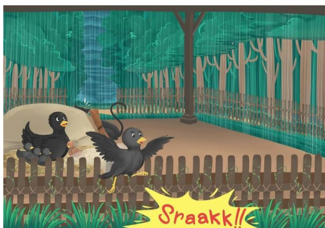
Fig 4. Photograph image of page 4 (Nusantara Katur Community)

Figure 4 is the fourth page in addition to the cover that utilizes text or typography elements applied to the visual display, as well as other pages that utilize the text as a supporting medium to strengthen the inclusion of a visual display of the story. In the above work, choosing 2 types of fonts used in the cover applies the script font type and Sans serif font type that is applied on each page. The type of script font in this work resembles the letters of a hand stroke that is done with a pen, brush or sharp pencil and is usually found with italics to the right. This script font also gives the impression of being personal and familiar. Then the sans serif font type is commonly known as a font without fins / serif, this type of letter does not have fins on the end of the letter and has the same or almost the same thickness. The impression generated by this type of letter is modern, contemporary and efficient.