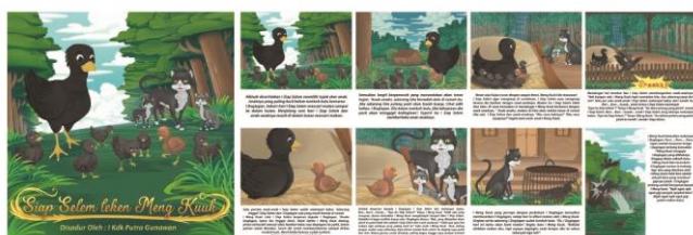
Fig 5. Photograph image of series stories Siap Selem taken Meng Kuuk (Nusantara Katur Community)

Figure 5 presents the Ready Selem picture story frame with Meng Kuuk signed on nine pages starting from the cover to the contents of the story.