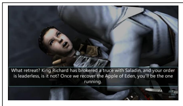
Fig 4. Richard The Lionheart and Saladin

King Richard 'The Lionheart' is the European armies commander, and Saladin is Muslims armies commander. Both armies are fighting in the Third Crusade in 1189-1192 as an attempt to reconquer Holy Land from Muslims under Saladin. Altair is an assassin operated under Saladin's Saracen and he does not realize about the reconciliation. He just know the information when he recaptured Maria Thorpe as in Fig. 4.