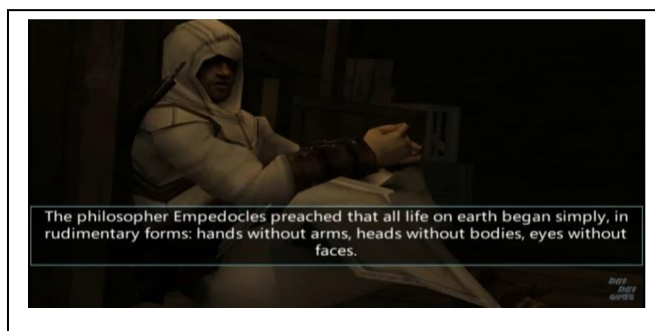
Fig 5. Empedocles

Fredrick the Red is a leader of Templar in Limassol and known for his brute manner. Fredrick has an equal rank in Templar Order with Bouchart so that Altair is operated to assassinate him. In the game play, Altair has succeeded to kill him as one of the ultimate enemies. However, he is often experiencing dilemma as an assassin which can be known as in Fig. 5 below.