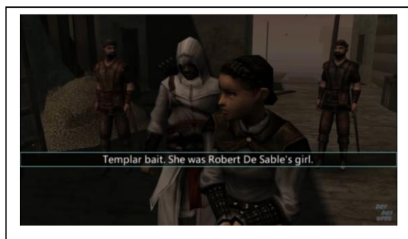
Fig 3. Maria Thorpe

Maria Thorpe is known as a former steward of Robert de Sable. She becomes one of the ultimate enemies defeated by Altair in the beginning of the play. She is captured by Altair and taken to the Safe House, but she is succeeded to escape during the journey to Cyprus. Next, she turns into Altair's wife. Altair is actually one of Saladin's branch army which had no information on a truce made by Richard and Saladin.