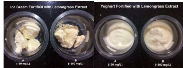
Figure 2. Ice cream and yoghurt fortified with 150 mg/L (A) and 1,500 mg/L (B) lemongrass aqueous extract.

Lemongrass aqueous extract is known to contain phenolics, tannins, and saponins [12-13], of which some of them showed an inhibition zone when tested on Lactobacillus acidophilus , L. rhamnosus , Streptococcus mutans , and S. oralis [14]. Though further confirmation is required, it is highly possible that the lemongrass aqueous extract also inhibits the growth of other lactic acid bacteria important for the fermentation in yoghurt, namely S. thermophilus and L. bulgaricus .