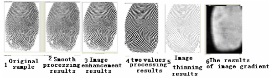
Figure3. A variety of fingerprint processed results

F(6)to determine whether there are not classified as a pixel, if the loop, until all pixel coordinates traverse the entire region.