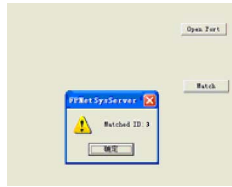
Figure5. Fingerprint identification result

Figure 5. Through the sample library to match the 20 samples, more than 90% efficiency.