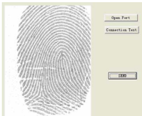
Figure4. Fingerprint identification procedure

Based on Figure 1 in the network topology, using Visual C++ 6.0 image acquisition written client program and server-side program, and pre-stored on the server 20 in the standard image of the fingerprint sample into the sample library, each sample number, parameter is set to \alpha = 1 , \beta = 1 , C = 1 , \rho = 0.05 , matching threshold is set to 85% segmentation block number 9, the first client device through fingerprint fingerprint samples sent to the server side, the run shown in Figure 4, the server receiving the transmission over after a fingerprint sample and the sample library to match the standard sample, if the match criteria for a successful match is displayed in the sample number, the operating results shown in