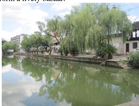
Fig.6 Public pier of adjacent river residence