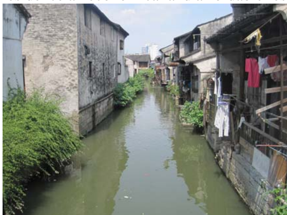
Fig. 2 A river with no street residence

are generally the living rooms or stores, the side near the rear are kitchen, toilet or warehouse, and the middle parts are used as bedroom or workshop and so on. The upstairs usually are bedrooms. This arrangement provides the residence with a high internal space utilization rate, and makes the adjacent river residence an economical and affordable residential form.