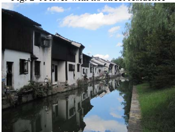
Fig. 4 A river and a street residence