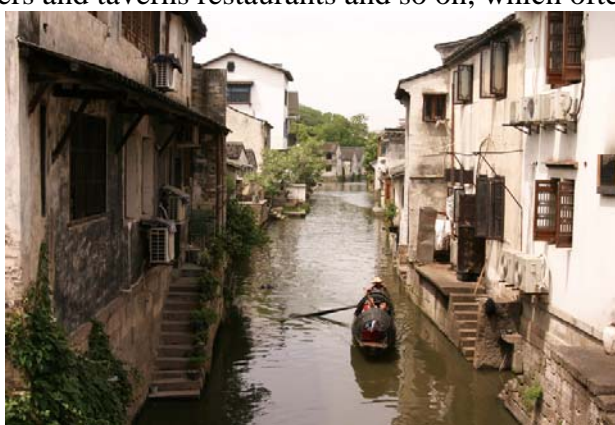
Fig.7 Private pier of adjacent river residence

There are various forms of private piers in the adjacent river residence, generally built along the shore. it is shown in figure 6. And some retreat part as the concave gallery, or set up a notch to leave stopping space to adapt to the narrow river and reduce the blocking to the water transport, and is also convenient for use in rainy days. Private piers have a variety of functions, such as getting water, washing, enjoying the cool air, aboard the boat, commodity trading not ashore, and so on. At the same time, it also plays an active role in using the river wind to adjust the microclimate. Sometimes, private pier combining with the platform form a very colorful and practical living space, making private pier an important part in houses near the water. However, the public pier is the product of transport and public supporting facilities. it is shown in figure 7. There will be a section of water dug out in a distance of the adjoining dwellings near the water to form a water plaza to build a public dock, which is convenient to ships calling and aboard, public washing, fire safety and other uses. In the prosperous areas, there are bridges to facilitate cross-bank exchanges, and near the bridge there are large public piers and taverns restaurants and so on, which often form a lively bazaar.