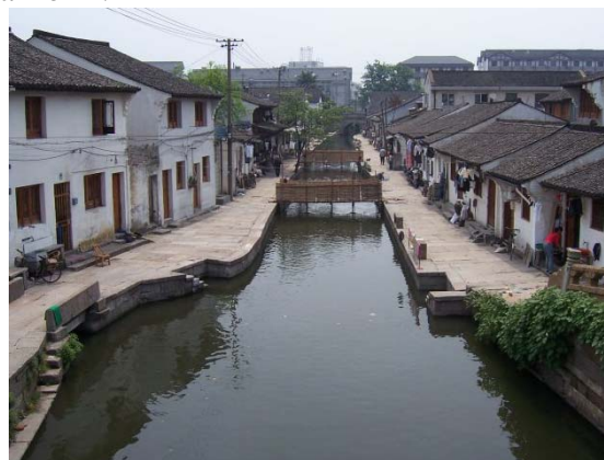
Fig. 3 Two streets mingle a river residence