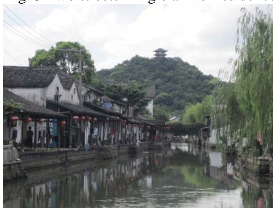
Fig. 5 A river and a covered street residence