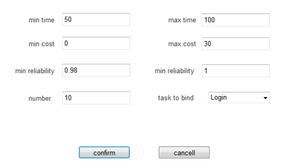
Figure 3 Wizard dialog to create virtual atomic services

Thirdly, virtual atomic services should be created. This can be done using the wizard dialog, in which the range of each QoS, the number of virtual services are needed, as shown in Figure 2. Then WS-SIM generates virtual atomic services automatically.