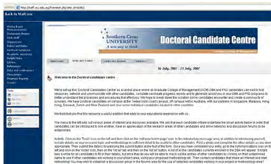
Figure-1: A Snapshot of the GCM Doctoral Candidates Centre

Southern Cross University’s Graduate College of Management (GCM) has set up an online knowledge repository called the ‘doctoral candidates centre’ where the College’s doctoral candidates can locate relevant information and academic resources, network with other candidates and complete their progress reports (Figure-1 is a snapshot of one of the Web pages from the candidates centre). Through the centre, doctoral candidates can also get a better understanding of the processes, procedures, practices of the doctoral programs in the GCM.