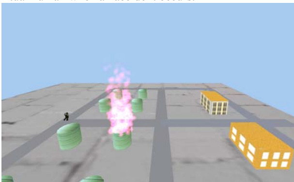
Fig.1 Particle system based gasoline pool fire simulation

Based on OpenGL, a simple 3D environment of a gasoline tank area is established, which is shown as Fig. 1. There are tanks (4m diameter and 4m height), buildings, roads and a virtual human in the scene. The main purpose of the simulation system is to analyze the response of the virtual human when an accident occurs.