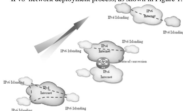
Figure 1 IPv6 network deployment process

IPv6 network deployment process, as shown in Figure 1.