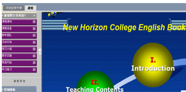
Figure 2: interface of Blackboard Learning System