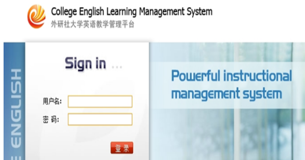
Figure 1: interface of logging in English Language Autonomous Learning Center