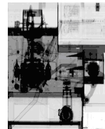
Figure 3. Logarithmic transformed image

If increasing the contrast of the dark area, can be transformed using a logarithmic, figure 3 is a logarithmic transformation of the effect after.