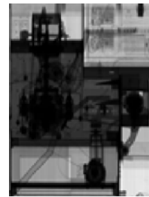
Figure 2. De-noised image