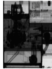
Figure 1. Experimental original image

First, using two-dimensional wavelet to denoise for ray image, effect diagram is as follows: