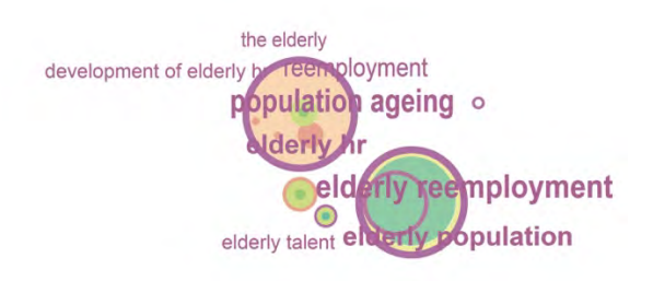
Fig. 1 Co-occurrence map of keywords

The analysis was made firstly using the software CiteSpace with the time range from 1986 to 2017, the time slice 1 year, the text run at default, the node type keyword, the keyword frequency threshold 30, the key network structure algorithm Pathfinder. After that, a co-occurrence map of keywords with 66 nodes and 171 connecting lines was obtained (see Fig. 1), in which a round node means a key word, with its size representing the frequency of the key word. The size of the label in the figure is proportional to the occurrence frequency of the word. The size of the line between the nodes reflects the degree of cooperation and tightness between the key words in this field. A circle with a thick edge means a hot research topic. The hot research topics are population ageing, elderly reemployment, elderly population, elderly talent, and birth rate. It can be seen that the topic "population ageing" connected with the topic of the elderly reemployment is an important research area. The "population birth rate" is a hot topic of research, but it has a far relationship with "elderly reemployment" and "population ageing".