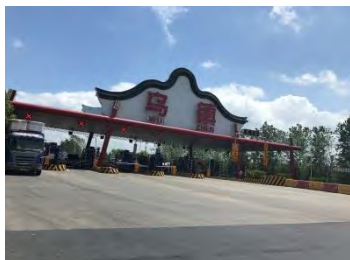
Fig. 3. Wuzhen Expressway Toll Station.