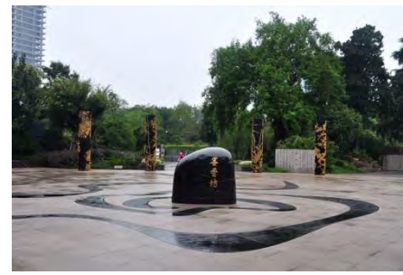
Fig. 6. "Ink Rhyme".

Landscape sketches are mostly traditional in terms of materials, colors, techniques, scales, etc., and their presentation forms are relatively simple (see "Fig. 7"). Landscape sketch is an important carrier for the characteristics of the urban era. It is a concrete manifestation of the humanization of the urban environment, and a product of social progress and the concept of the times. The forms of landscape sketch should use the latest design ideas and concepts as much as possible, emphasizing the originality and diversity. It should strive to enhance the aesthetic taste of art on the basis of satisfying the use functions, and add elements such as multimedia, installation, film and television, and behavior to make it easy, cheerful, fashionable and