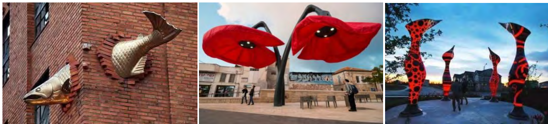
Fig. 7. Huzhou Landscape sketch.

Landscape sketches are mostly traditional in terms of materials, colors, techniques, scales, etc., and their presentation forms are relatively simple (see "Fig. 7"). Landscape sketch is an important carrier for the characteristics of the urban era. It is a concrete manifestation of the humanization of the urban environment, and a product of social progress and the concept of the times. The forms of landscape sketch should use the latest design ideas and concepts as much as possible, emphasizing the originality and diversity. It should strive to enhance the aesthetic taste of art on the basis of satisfying the use functions, and add elements such as multimedia, installation, film and television, and behavior to make it easy, cheerful, fashionable and