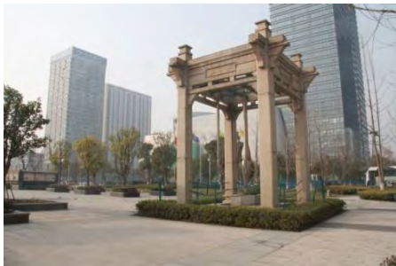
Fig. 5. "Pen Pavilion".