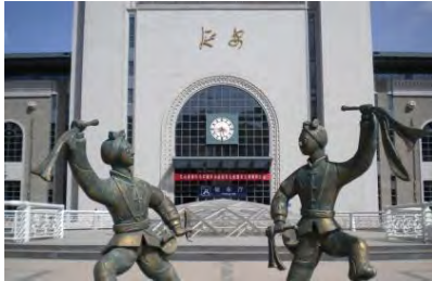
Fig. 1. The sculpture of Yan'an Railway Station Square.

climate to understand the emergence of certain art... The products of spiritual civilization are the same as the animals and plants. It can be explained from the respective of its own environment." Therefore, the landscape sketches of historical and cultural cities should be rooted in the specific environment. Influenced by the regional culture, the city's topography, history, context and citizen's temperament are vividly shaped. The sculpture of Yan'an Railway Station Square reflects this local culture (see "Fig. 1"). Of course, the architectural design of the railway station also uses local cave dwelling styles. The recognition for people is highly unified and holistic. In addition, the Suzhou City Bus Station (see "Fig. 2") and the Wuzhen Expressway Toll Station (see "Fig. 3") are consistent with the regional culture in the design.