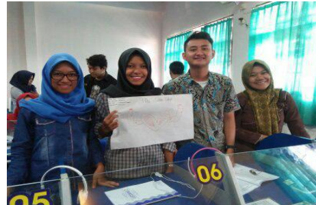
Figure 5. The students' group assignment

The group assignment is also assessed in the listening class to build the students' team work. This kind of activity helps the students to share their critical thinking with the others. The students also can share their perceptions after listening or watching TED-ED video. The sample of data that is in line the aforementioned explanation is mentioned in Extract 9.