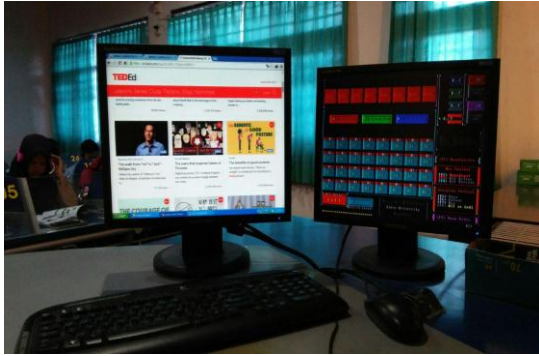
Figure 2. Using TED-ED in listening class

"I use TED-ED videos to support my teaching and learning process. The videos are great to improve my students' speaking skill."