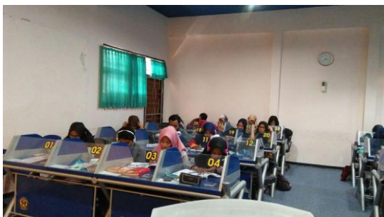
Figure 3. The students do the questions from one of their friends

"I ask my students to access TED-ED and create listening questions and provide the key answers as their individual assignments. After that, I ask my students to give the questions to the others."