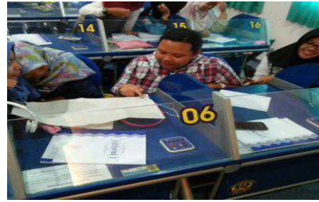
Figure 4. The students do group assignment