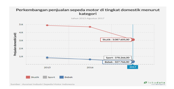
Figure 3. The selling of motor-bikes in Indonesia

The illustration above shows that ages of victims are varies. Nevertheless, it is remarkable that middle-age victims are the second large group. Just because of many young people are vulnerable to inflict fatal injury, it does not necessary mean that mature aged people are safe and beyond risks. The data does not show remarkably whether this second large group is men or women. Nevertheless, both genders potentially include and ironically women took half of the part as victims.