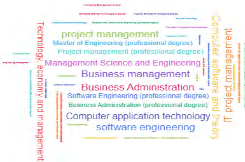
Fig. 1 Chinese literature source word cloud

Author's Professional Analysis: From the display of the author's professional word clouds of Chinese literature (as shown in Figure 3), the major occupying a larger proportion are: project management, management science and engineering, business management, project management (professional degree), software engineering, business management (professional degree), business management, computer application technology, software. Engineering (professional degree), computer software and theory, Master of Engineering (professional degree), technology, economy and management, etc. Among the majors with more than 10 publications, the management majors accounted for 66.7%, and the computer majors accounted for 33.3%. It can be explained that in the research of software project risk, management specialty has a large proportion of research on software project risk management, while computer technology-based research is relatively weak.