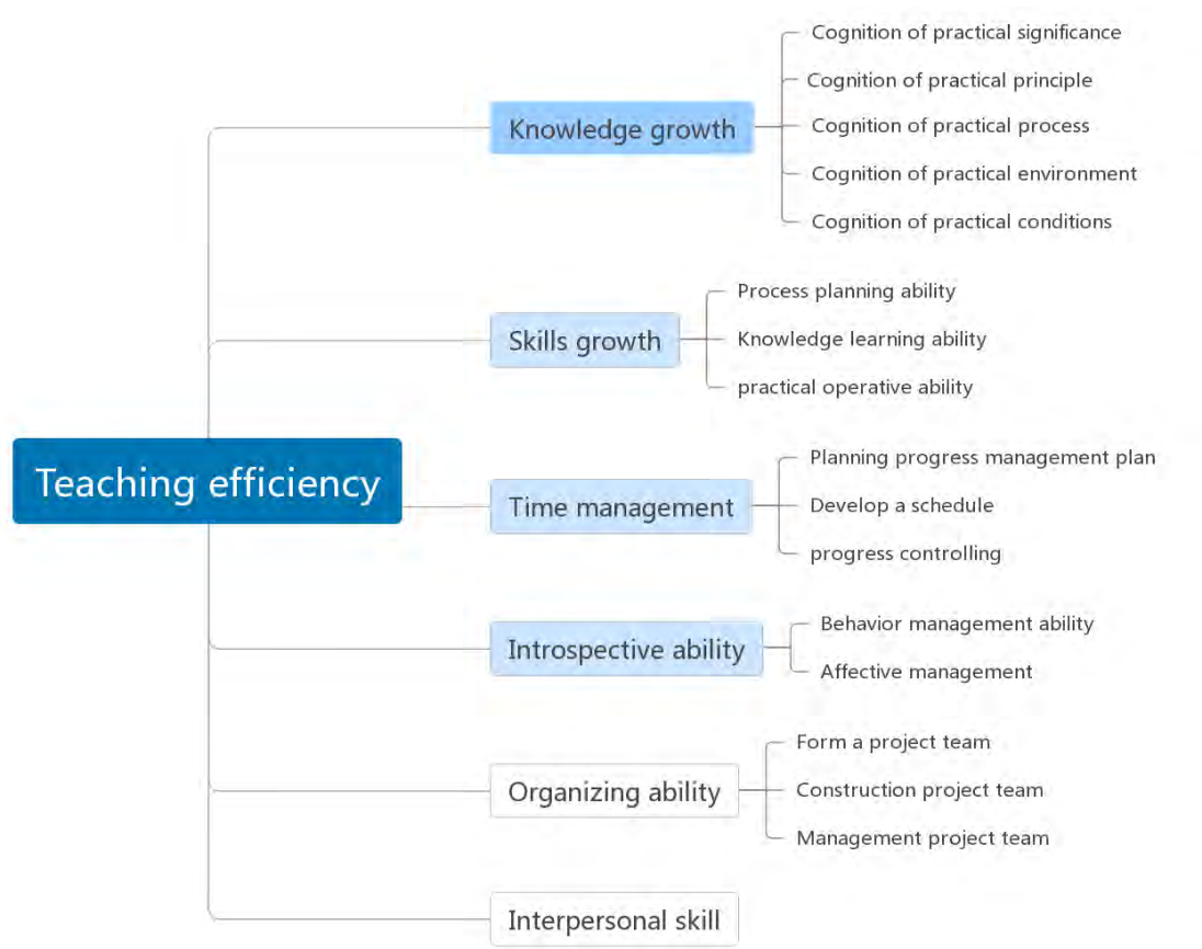
Fig. 3. Teaching effect evaluation