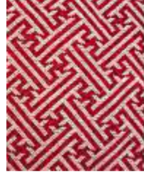
Fig. 9 Traditional “万”-Shaped Flowing Water Flower

The “万”-shaped flowing water flower is an auspicious pattern with Tujia style. It implies the auspiciousness, happiness, the desire for a bright future as well as well-being. Tujia people believe that it can bring peace and good luck to people. It is not only a reflection of faith, but also an expression of traditional auspicious pattern ® (see Figure 9)