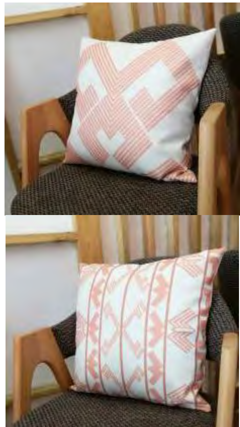
Fig. 7 Finished Products with Single Eight-Hook Pattern and Examples of the Pattern Designed by Shang Qianli

In Figure 7, pink is mainly used in the products. The product positioning is that it is used in young women’s room. It emphasizes soft temperament, so the color should not be too much. Other color scheme is the simple combination of black and white, which is more visually impactful and suitable for use in eye-catching places. It is designed for use in floor mat, storage bag and others (Figure 8).The re-combined pattern of Xilankapu has some exotic temperament (Islamic style), and the innovative design based on modern fashion trends also enriches the application of Xilankapu.