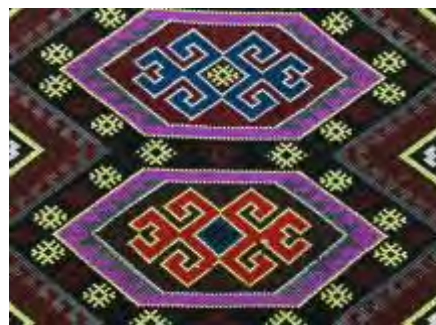
Fig. 4 Traditional Single Eight-Hook Pattern

With symmetrical hook patterns with same size, Single eight-hook flower has a profound meaning. There are four sets of geometric hooks in a single eight-hook flower. The upper and lower sets of hooks represent newly married couples, family members and ancestors. The left and right sets of hooks represent the world. The meaning of the hook pattern is enjoying a happy life, and everything going well. It expresses the desire of the Tujia people for a happy and beautiful life. This beautiful wish is woven into the single eight-hook flower and passed on to next generations ⑧ (see Figure 4).