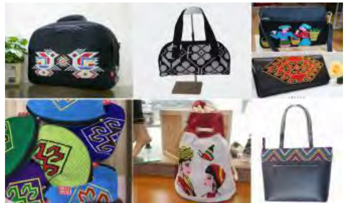
Fig. 1 Existing Designs of Tujia Brocaded Bags

color of the pattern are used ingeniously and the “modern design gene” can be explored and used reasonably, the design will be closer to the modern aesthetic standard. Based on the traditional design, the improved design makes the existing products get rid of complicated form to carry out design innovation to meet the needs of modern life.