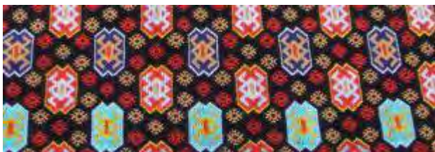
Fig. 2 Traditional Pattern of Spider Flower

Spider flower (see Figure 2). Tujia nationality thinks that the spider flower symbolizes the accumulation of wealth, a heaven-sent fortune, auspiciousness and good luck. The spiders gather together to celebrate the happy events. And the spider flower is used in the design of the handbag to represent that the money is gathering, and good luck will come.