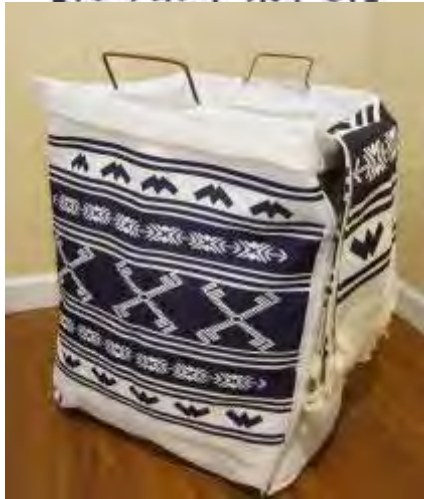
Fig. 8 Single Eight-Hook Pattern Design Color Scheme and Application in Carpet Designed by Shang Qianli