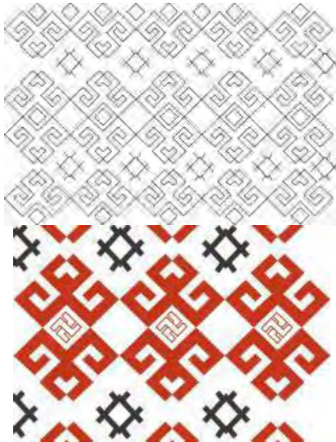
Fig. 5 Scheme of Combination of Single Eight-Hook Pattern and “万”-Shaped Pattern

The traditional Tujia brocade pattern is colorful ® . Red symbolizes auspiciousness. A combination of red and white is always used. Pay attention to the relationship between pattern distribution and overall white space and coordinate the color proportion. And the advantages of traditional Tujia brocade pattern color using contrasting colors shall be learned to unify the spirit and aesthetics to make the product and the user echo in emotion.