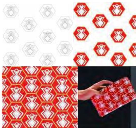
Fig. 3 Design Scheme of Spider Flower Designed by Tao Weitong

price is more affordable. The production process is also a major problem to be solved in the production of Tujia brocade. The rational use of modern science and technology is also conducive to market development and brand expansion ⑦ (see Figure 3).