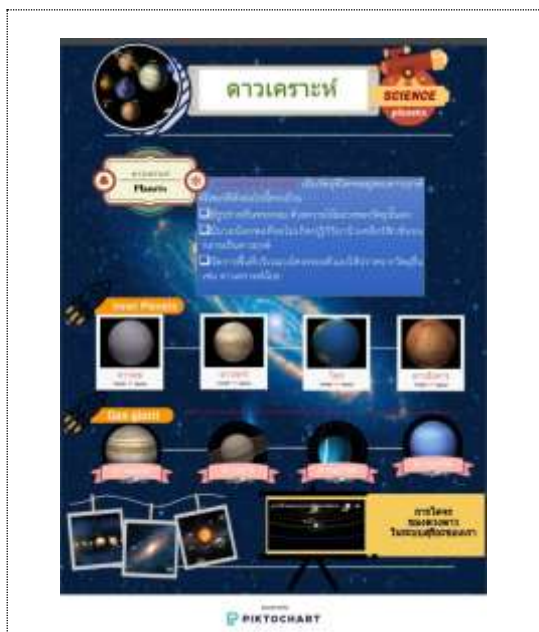
Figure 3. The Infographic Example of the Teachers and Students

The lesson plans had developed based on problem-based-learning, 5E model, project-based-learning, situation-based-learning and active learning. The use of ICT and the science contents can summarize as follow.