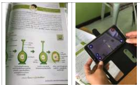
Figure 2. AR in science e-book

It provides interactive test and questions that easy access by QR code card and register number via smartphone. The most popular is multiple choice test, true or false quiz and short answer test. Science e-book for the student in Thailand was created to fill AR in some topic as the picture below (Ipst, 2018). For the Piktochart.com, it can help the learners design and create their own infographic to reflect the concept, law theory and information of scientific understanding.